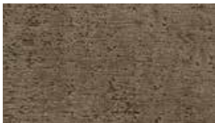
N135 100% Ply PR N/A W 142cm