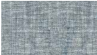
N105 58.7% Textured Ply 41.3% Ac PR N/A W 140cm