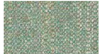
N117 100% Ply PR N/A W 138cm