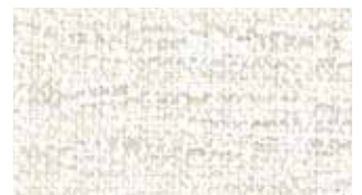
N150 100% Ply PR N/A W 140cm