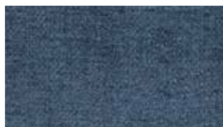
N156 100% Ply PR N/A W 138cm