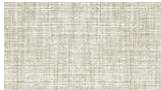
N106 58.7% Textured Ply 41.3% Ac PR N/A W 140cm