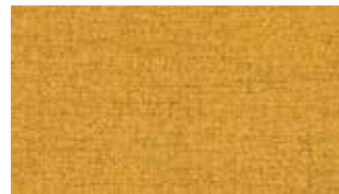
N125 100% Ply PR N/A W 138cm