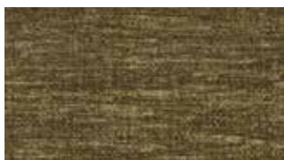
N155 100% Ply PR N/A W 138cm