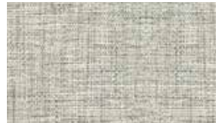
N107 58.7% Textured Ply 41.3% Ac PR N/A W 140cm