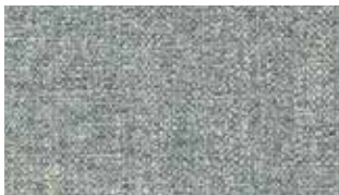
N118 100% Ply PR N/A W 138cm