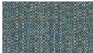
N119 100% Ply PR N/A W 138cm