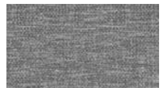
N157 100% Ply PR N/A W 138cm