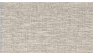
N154 100% Ply PR N/A W 138cm