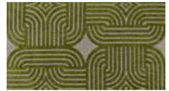
N143 100% Ply PR 36.5cm W 138cm