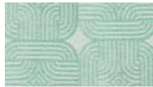
N142 100% Ply PR 36.5cm W 138cm